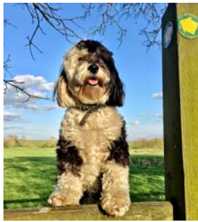
Milly has been busy joining in Green Week Walks and showing 'Jeff' the ropes on how to answer the letters.